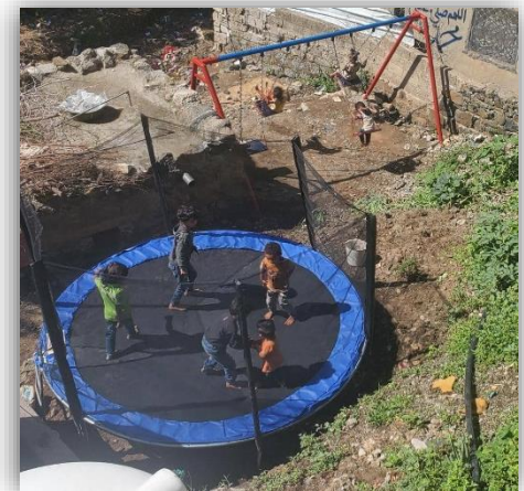
Garden-child tools in the IDPs site, Upper Haraziya for supporting the children psychosocially

However, the response was not delayed. BCFHD fulfilled its role as CCCM and issued an urgent call to all partners in the area for a rapid emergency response.