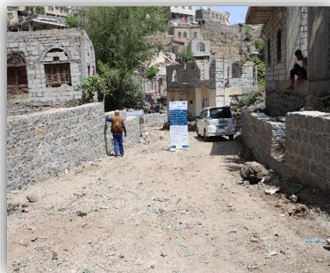
Constructing protective walls for flood rain risks

These garden-child tools brought back the lost smiles to the children, who had been deprived of them due to the disasters of floods and war. They served as the only outlet for the displaced children at the site.